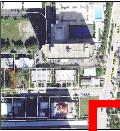
AERIAL MAP (NOT TO SCALE)